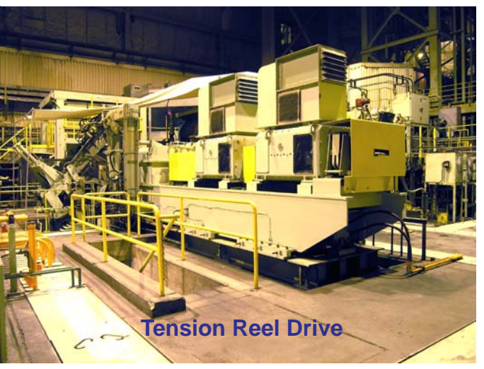
Line Located in Ohio, USA Contact Dev Lemster for inspection or additional information Complete documentation and detail drawings available Line to be sold as a complete line or by major components, or the line can be operated on site by a new owner.