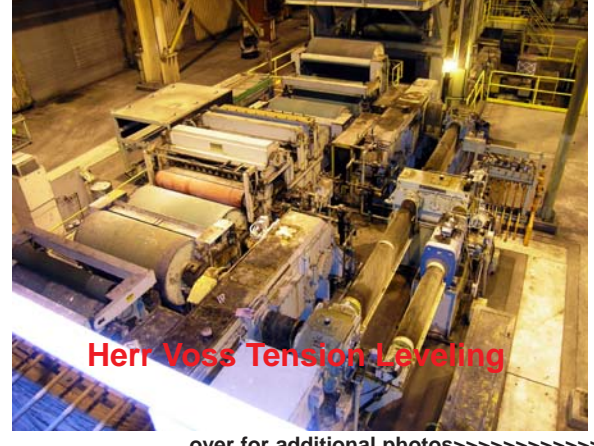
over for additional photos>>>>>>>>>>