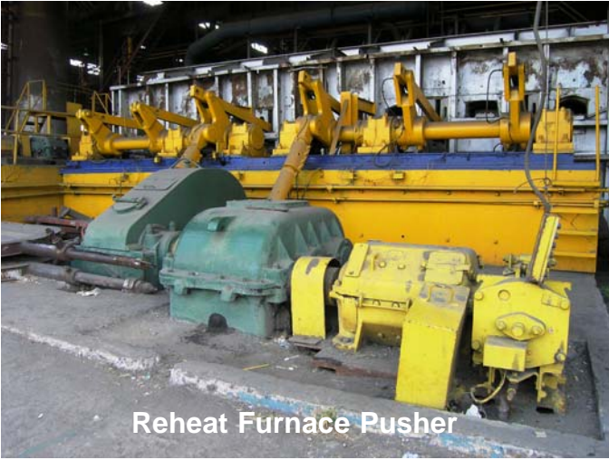
Reheat Furnace Pusher