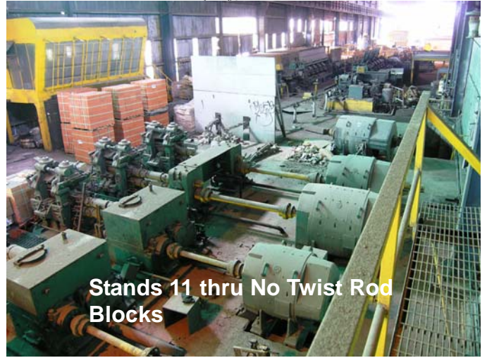
Stands 11 thru No Twist Rod Blocks