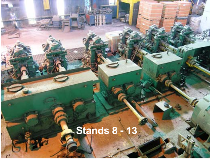
Stands 8 - 13