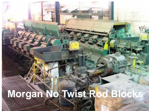
Morgan No Twist Rod Blocks