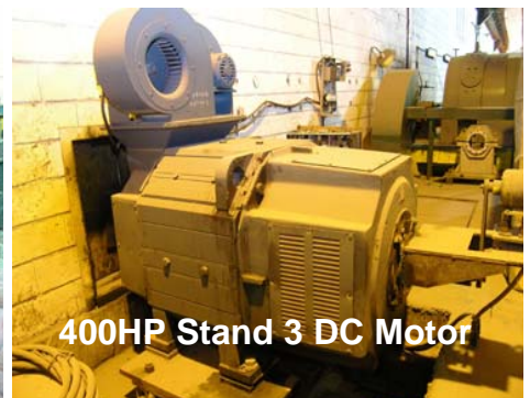
400HP Stand 3 DC Motor