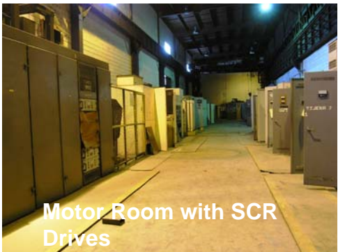
Motor Room with SCR Drives