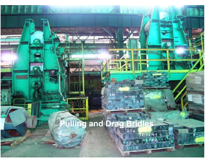
Line located Midwest USA. Contact Dev Lemster for pricing and inspection.